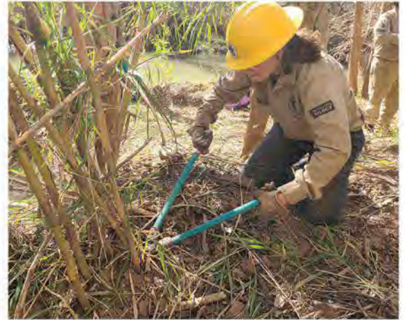
Above: Members of the AZCC crew treating giant reed at the Reeve's property during training