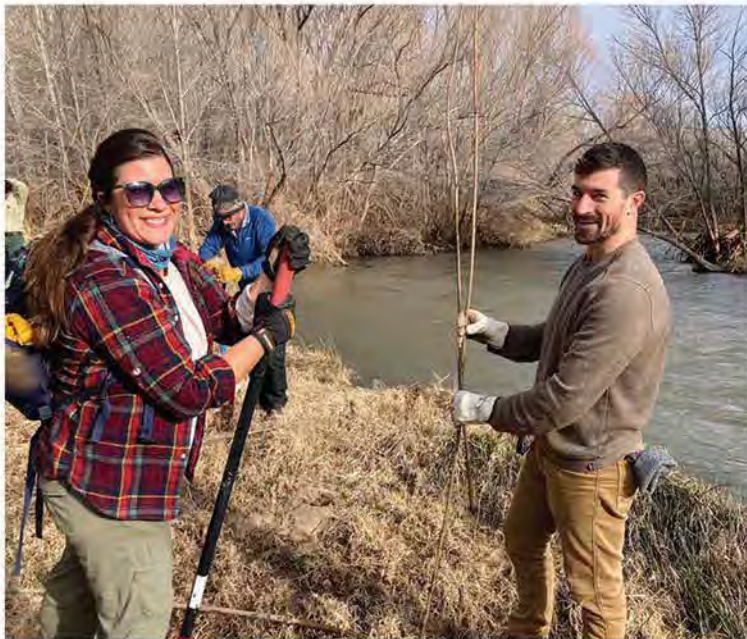
Volunteers plant native willow trees near Clear Creek River Access Point with the Prescott National Forest and Camp Verde.