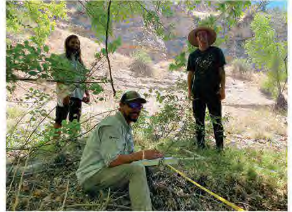
Above: The 2022 spring monitoring crew collecting data along West Clear Creek.

In the spring of each year we map and monitor invasive plant growth and native plant recovery. Our three-person crew worked for two months in 2022. The team monitored a total of 1,424 acres throughout 27 river miles within the watershed. Sites of focus included part of the upper Verde, 89A - Bignotti, lower Oak Creek, and the river section through Camp Verde.