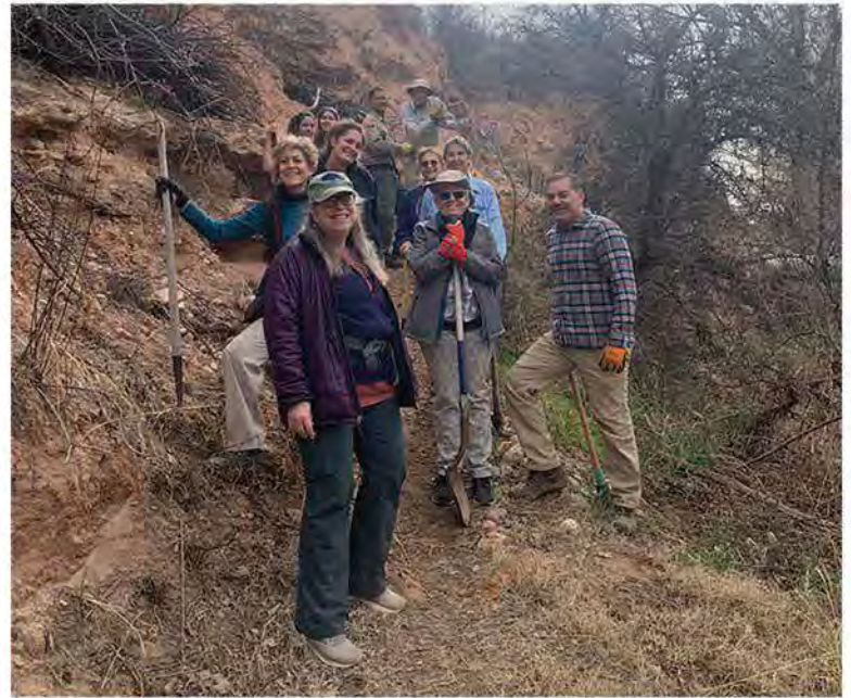
Volunteers restore a portion of trail that was washed away during a major flood event. By restoring this trail, we can encourage hikers to stay on one path and have less impact on the surrounding environment.

This was my first volunteer event I've participated in at Camp Verde as the Economic Development Specialist. Having worked with the Friends of the Verde in the professional setting, so I thought it was high time that I got my hands dirty a little bit by doing some tree planting along the Verde River. We had a diverse mix of folks, some even came up from Phoenix to help plant Willow trees and I honestly had a great time. It was great to help the natural habitat here in Camp Verde and it was fun meeting new people who are passionate about the environment. I would recommend other people and organizations to work with the Friends of the Verde River on volunteer activities and events!