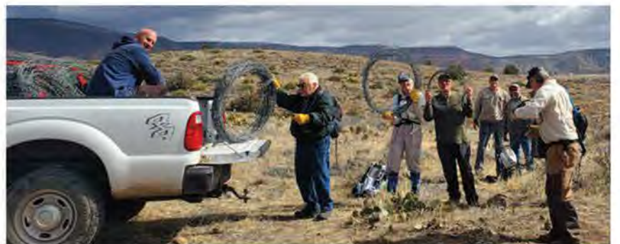
Above: Volunteers removing unnecessary fencing to allow free movement for pronghorn.