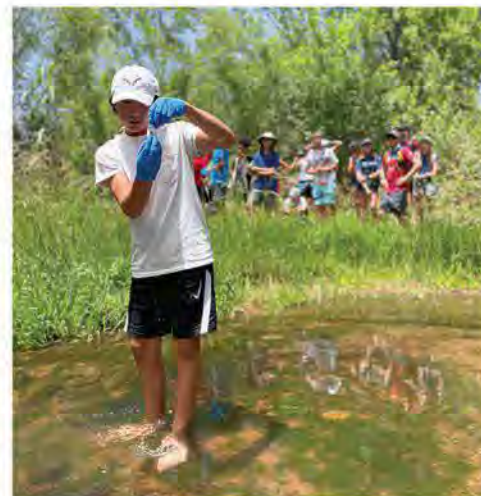
Middle school students learning how to collect water quality samples on Oak Creek.

"For nearly a year now we have been going out, once a month, to area streams to collect water samples and monitor water quality for Friends of the Verde River. It is rewarding to know that our sampling will allow the state of Arizona to better categorize and track the cleanliness of our most precious resource. Equally rewarding has been the chance to make friends with our fellow volunteers and to return through the seasons to our sampling sites, often at remote locations along our area streams, taking pleasure in the continually fresh sights and sounds of our local riparian habitats." - Community scientists George and Brennan