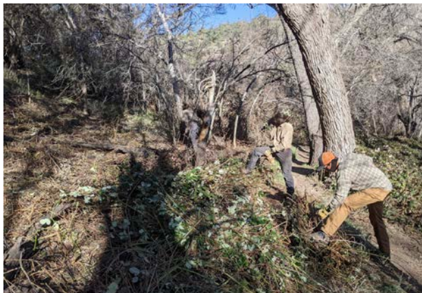
Fossil Spring Blackberry Removal