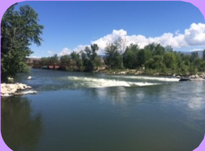
Overlooking the Boise River.

The plan is ambitious. It places resource protection as its number one goal. And it is sensitive to the impacts recreation, both managed and unmanaged, has on landowners who live along the banks. So when offered the opportunity to travel to Boise, Idaho, for the 2016 River Management Symposium and Outdoor Recreation Conference, I jumped at the opportunity.