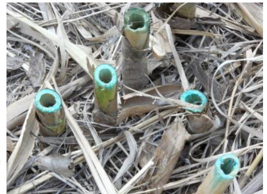
Arundo donax herbicide treatment

restoration work, and ensure the success of the "Arundo Free Oak Creek" campaign. On average, it costs over $3000 an acre to remove this invasive plants,