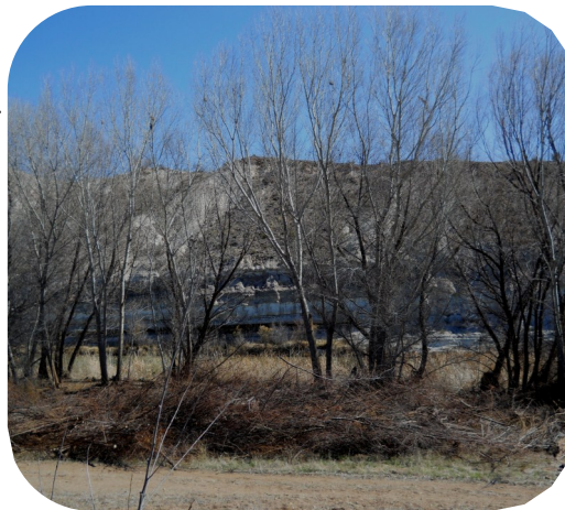
After tamarisk removal at Rockin' River Ranch

These Demonstration Projects were funded by grants received by FVRG from the Walton Family Foundation (WFF) and Resource Advisory Committee (RAC). Numerous VWRC partners assisted VWRC staff with these projects and contributed over 100 hours of in-kind volunteer labor.