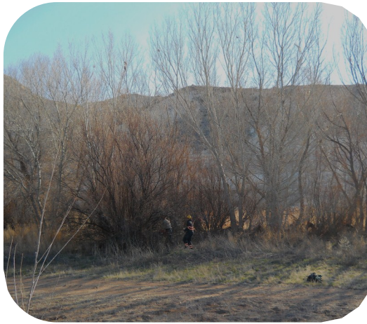
Before tamarisk removal at Rockin' River Ranch

The crews removed several large patches of Arundo, a hill of Tamarisk and at least 15 acres of Tree of Heaven. The large stand of Tree of Heaven was visible to passersby from Salt Mine Road, some of whom stopped see our progress. We experimented with several different treatment methods and herbicide combinations on the Tree of Heaven. We will monitor the effectiveness of these treatments closely and use adaptive management to guide future treatments. Crews also worked the east side of the river at Park Central, private farmland. Crews removed several large diameter tamarisk trees in the upper sections of this site. With bad weather in the forecast, we moved the crews to level terrain. During the rain, crews continued to cut the invasive plants without treating with herbicide. Crews will come back to these sites in the fall and make a second cut and treat with herbicide to complete the treatment. CREC crews cleared over two acres of invasive plants for this private landowner.