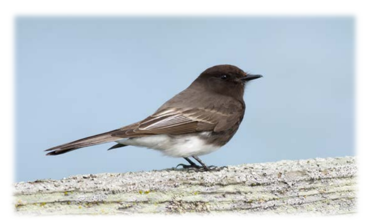
Black phoebe, Photo: © Frank Schulenburg, CC-BY-SA-3.0

The male gives the female a tour of potential nest sites, but it is the female who makes the final decision and