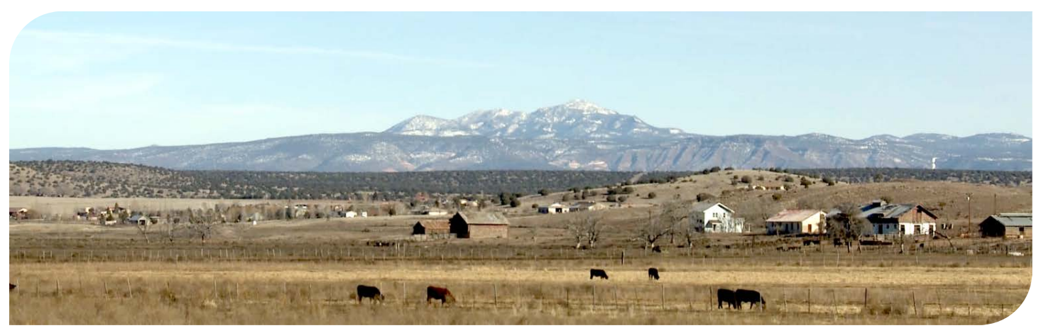
Low-density, rural-residential land use in Yavapai County, photo by Big Picture Media