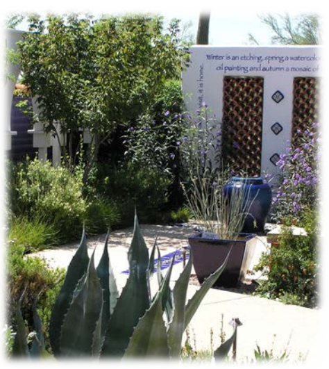
Xeriscaping and irrigation specifications are some tools for helping reach water-use goals.

The state requirement does not call for specific policies, objectives, and implementation measures to assess how the goals of the community general plans will be met, nor does it ask for evaluation methods or benchmarks. There is no requirement to evaluate water acquisition and use against other elements in the plan such as economic development or quality of life, which are often dependent on the preservation of natural assets. Additionally, the language does not require regional coordination and planning. In some areas of Arizona called Active Management Areas (AMAs), intercommunity planning within the AMA boundaries is required, yet even within AMAs, there are concerns about plan enforcement and the absence of requirements for regional planning with nearby communities outside the boundaries.